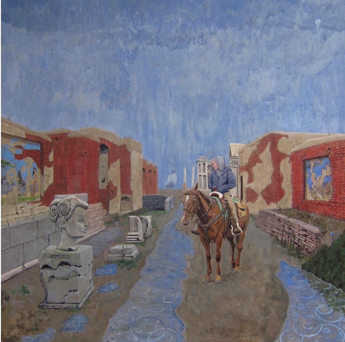
Rider in the Rain