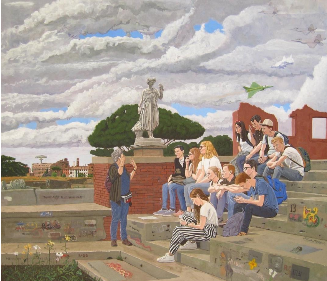
A Day in the Forum

You can view this exhibit during regular library hours (unless a program is happening) all month. A portion of sales are donated to the library. www.bainbridgepubliclibrary.org .